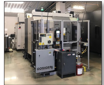
Okuma machine cell.

When Glacier Tool and Die integrated their robot with the Okuma M-460VE and GOSIGER automation package, they reached their goal of achieving more efficiency and high productivity. The system is running lights out 24/7, simply sending a text message when there is problem with the machine to minimize any unplanned down time. Furthermore, automating the cell freed up two operators to work on other projects in the shop.